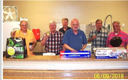
The United Methodist Men held their monthly breakfast meeting Saturday, 9